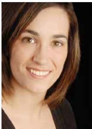
Special Guest from London