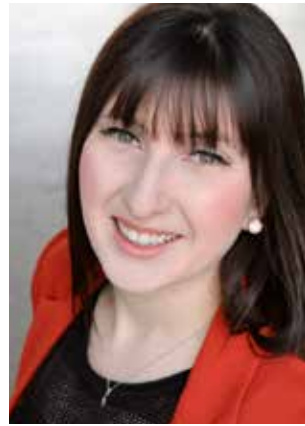
Special Guest from Edmonton