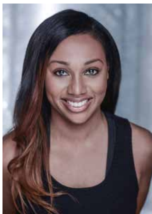
Special Guest from Toronto